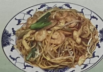
House Special Lo Mein