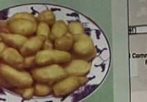
Sweet & Sour Chicken