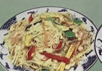
House Special Chow Mei Fun