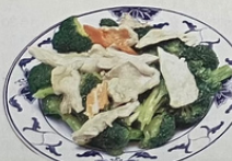
Chicken w. Broccoli