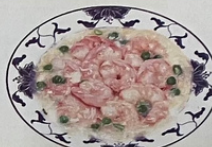
Shrimp w. Lobster Sauce