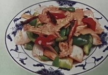
Szechuan Chicken w. Mixed Vegetable