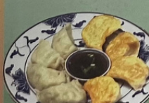
Fried or Steamed Dumplings