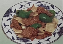
Pepper Steak w. Onion